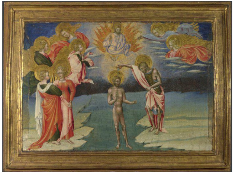
The Baptism of Christ Giovanni di Paolo National Gallery of London

This is the word of the Lord. Thanks be to God.