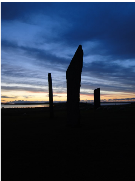
Stones of Stenness

Three pictures from Orkney to fill the page ... (with a Trinitarian theme)