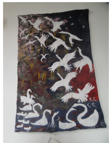
The Kirk on Papa Westray